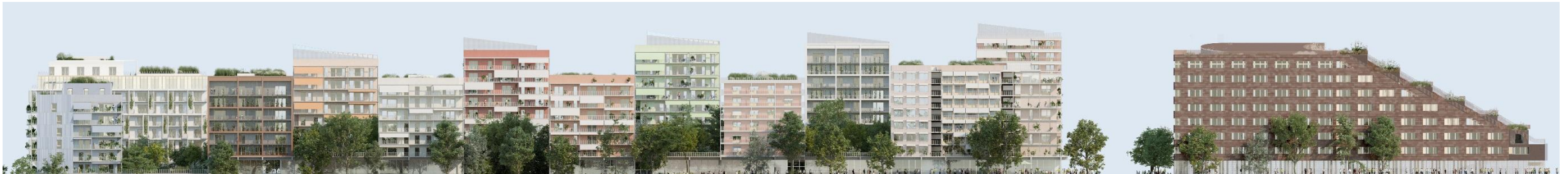
ATHLETES VILLAGE Saint-Ouen, Seine-Saint-Denis

2020 dividend stable vs. 2019, at €4.0 per share subject to shareholder approval at the General Meeting