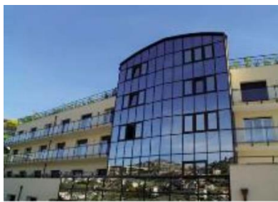
Residenza Anni Azzurri Franchiolo – Sanremo

Specialised in elderly care, in addition to rehabilitation and psychiatric care, the KOS Group is Italy's leading operator in this segment. It currently operates over 140 facilities (around 12,800 beds) in both Italy and Germany.