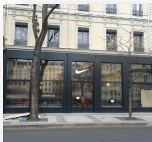
Nike Store, Lyon

These highlights illustrate ANF Immobilier's repositioning strategy for its retail premises on rue de la République in Marseille, with a dual objective: standing out from the crowd and renewing its commercial appeal.