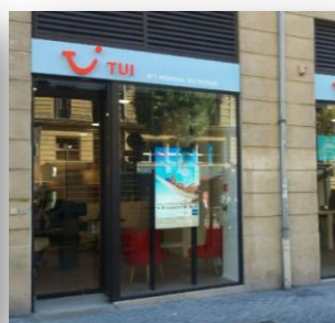
TUI Store, Marseille