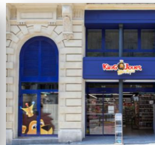
King Jouet, Marseille

In Lyon, after having won the 2013 bid for the acquisition of the Banque de France building on rue de la République, ANF Immobilier met its target of completing the conversion of the historic building in barely 3 years. Nike opened its 500 sq.m. outlet in March while Maxibazar opened in September in premises covering 2,000 sq.m. The operation has already proven successful for both brands.